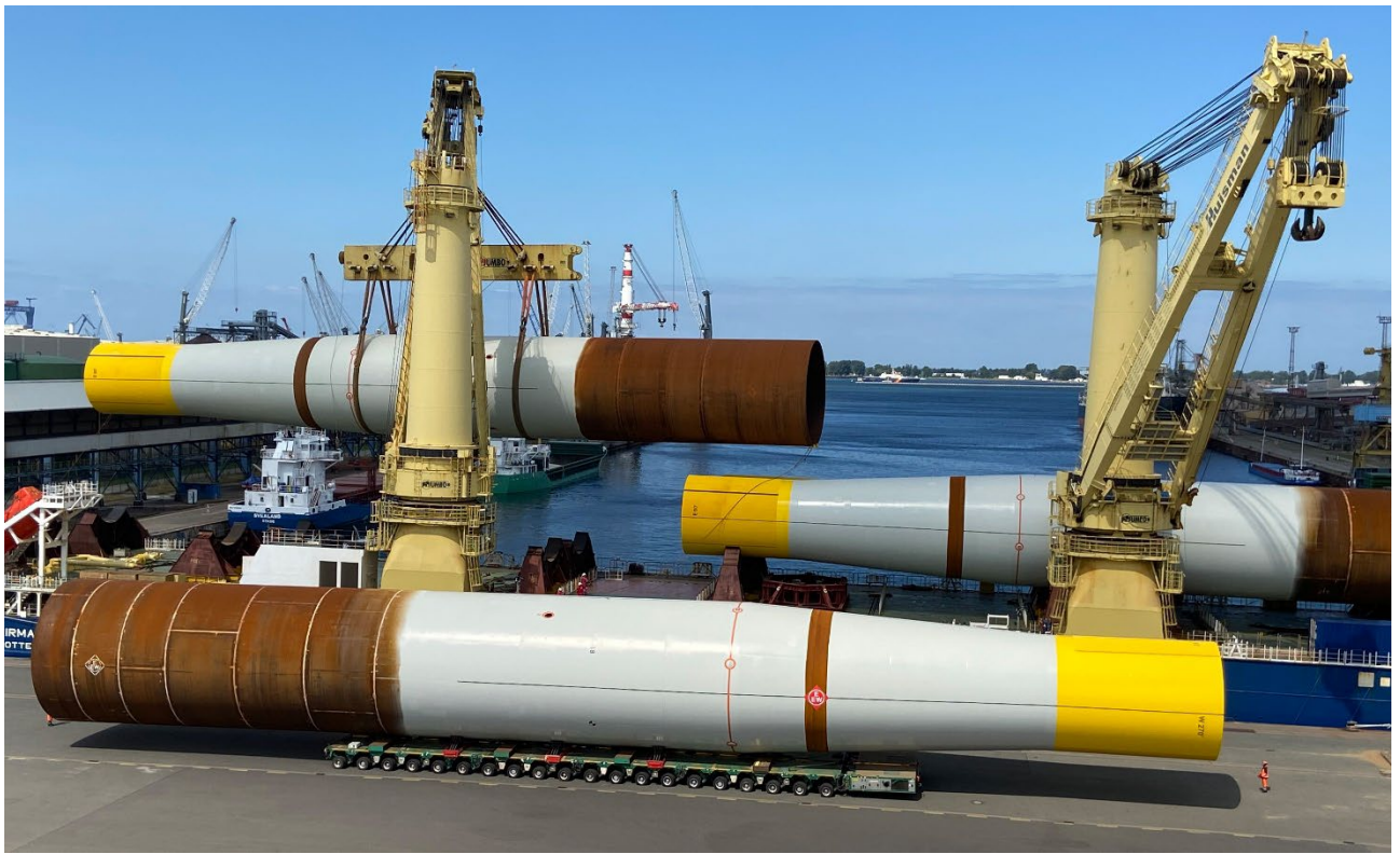
Image 1: Monopile being loaded at EEW SPC quayside in Rostock, Germany.